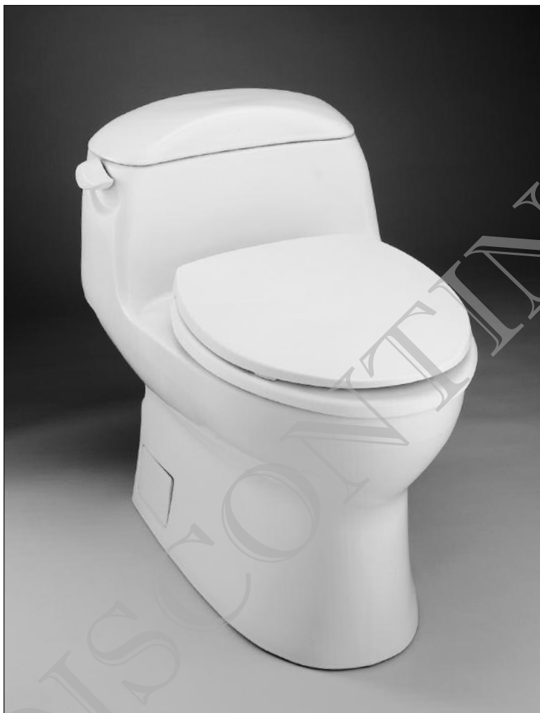
MS914114 - Toilet with SoftClose Seat