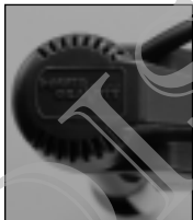
MS894114 - Prominence Toilet with SoftClose Seat

Power Gravity: A powerful and quiet flush, every time.