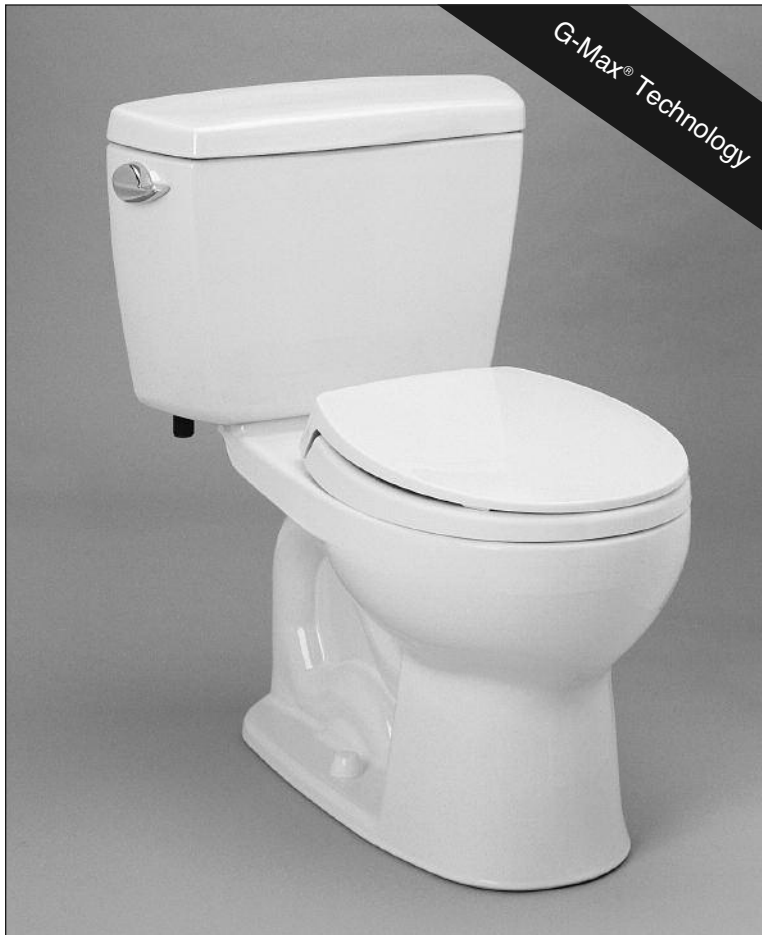
CST743S - Drake Close Coupled Toilet with SS113 - SoftClose Seat