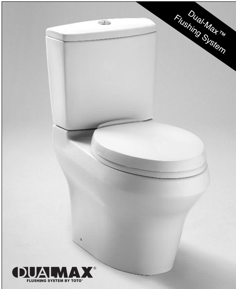
CST464MF - Aquia III Toilet SS204 - SoftClose® Oval Seat