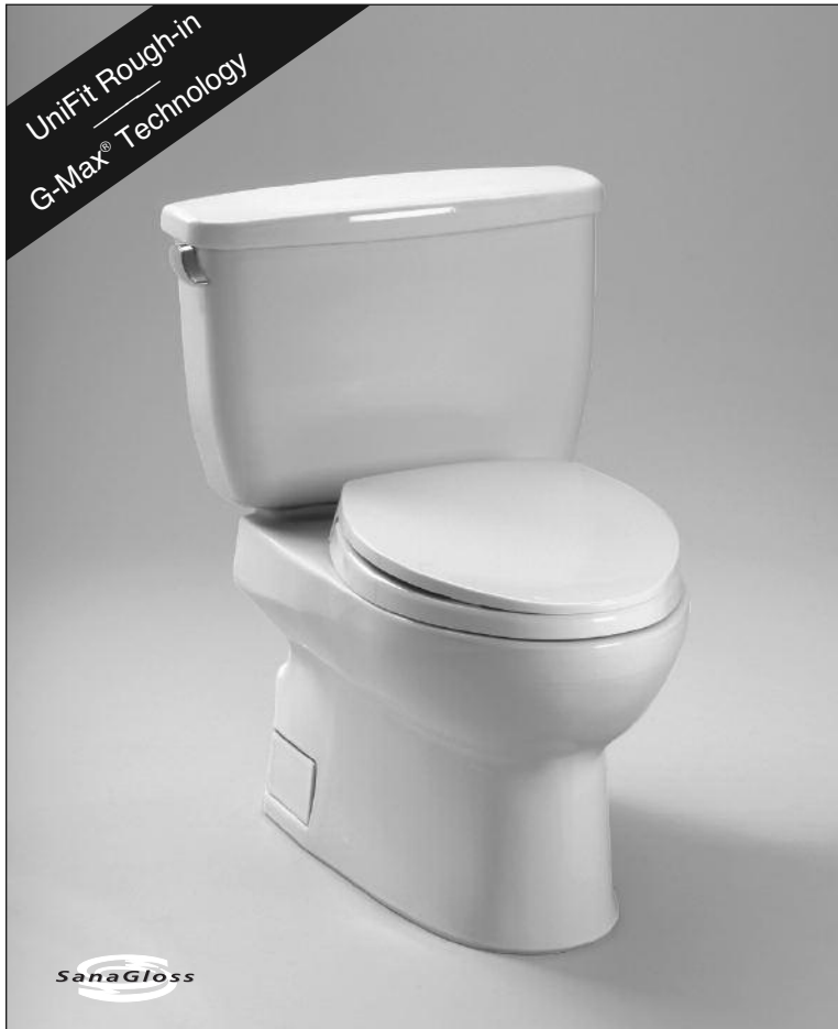
CST764S(G) - Vespin Close Coupled Toilet with SS114 - SoftClose Seat