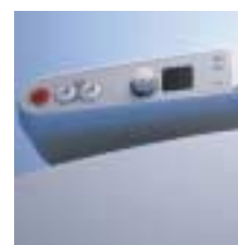
Convenient activation panel