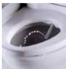
Gentle warm water cleansing