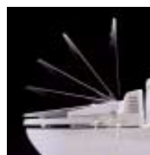
Engineered with TOTO's SoftClose Seat to eliminate annoying "toilet seat slam"