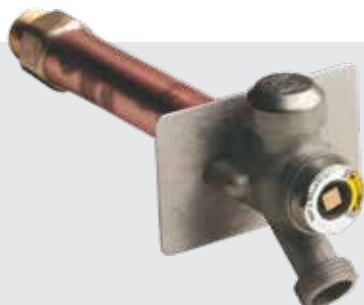
FIG. # 5609QT