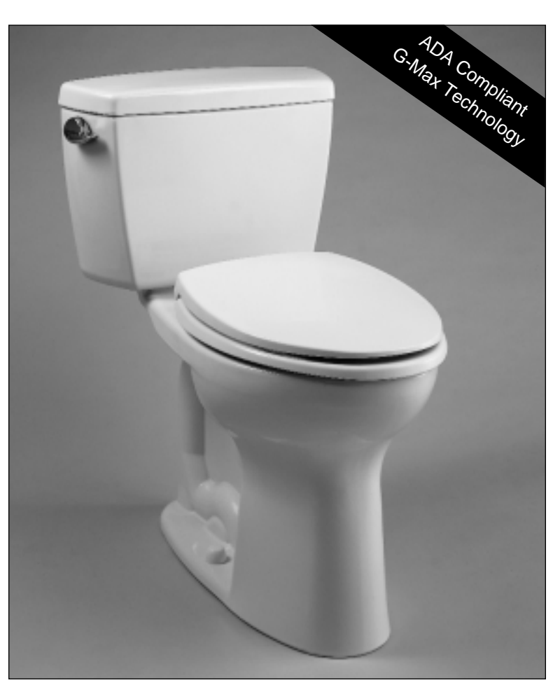
CST744S - Drake Toilet, ADA Model SS114 - SoftClose Seat