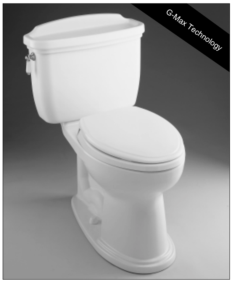
CST754SF - Dartmouth Toilet SS154 - Traditional SoftClose Seat